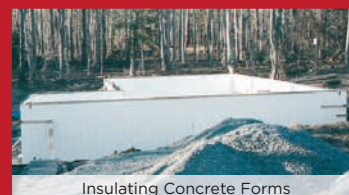
Insulating Concrete Forms